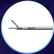
PRECISE AND DELICATED BLADE