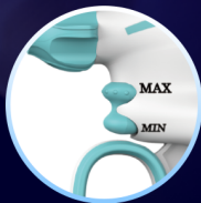
ERGONOMIC BUTTON DESIGN